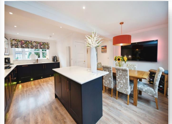
Dalgarven Wynd, Kilwinning KA13 6DD