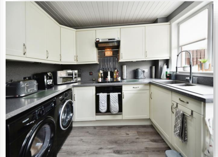
Fencedyke Close, Bourtreehill North Irvine KA11 1NZ