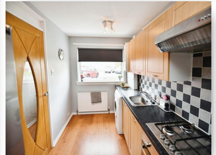
Lewis Rise, Broomlands Irvine KA11 1HH