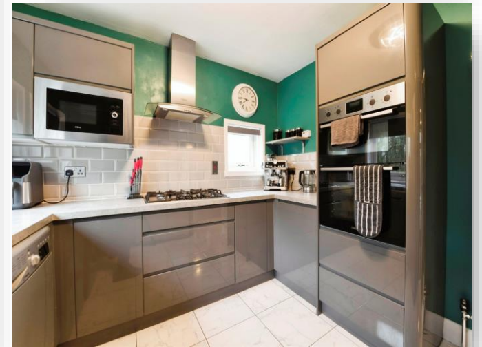
Lanfine Terrace, Girdle Toll Irvine KA11 1RJ