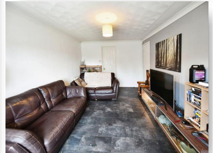
Woodside Road, Kilwinning KA13 6PE