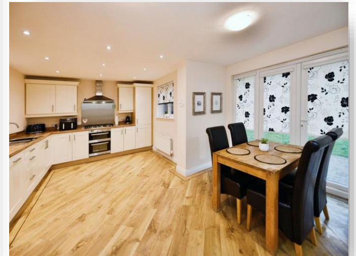
Pennant Court, Irvine KA11 2GF