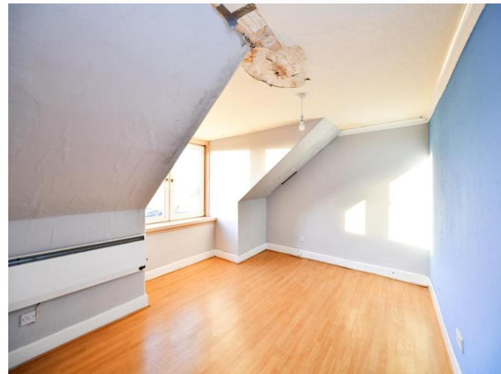
High Street, Irvine KA12 8AA