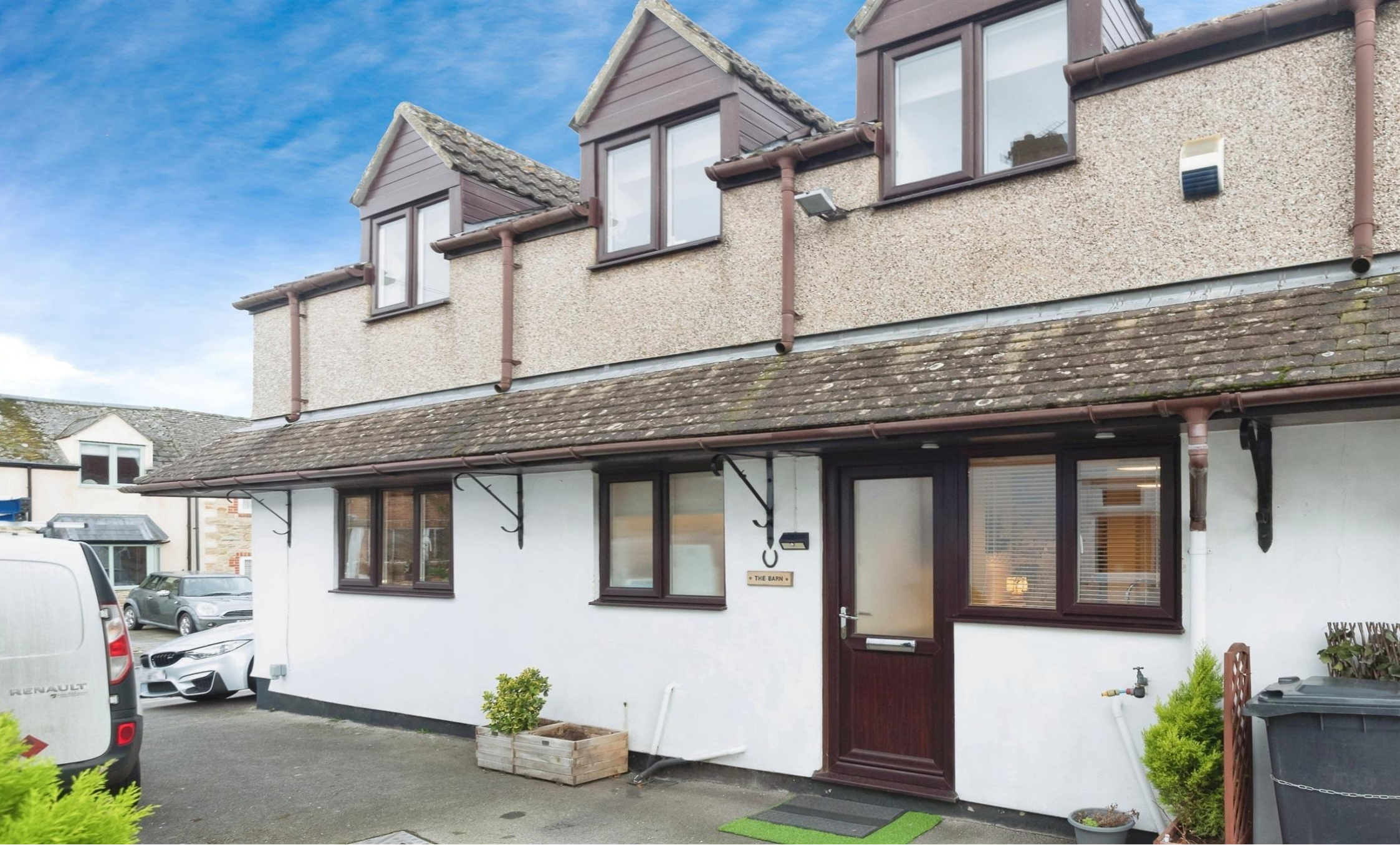
The Barn Westrop, Highworth Swindon SN6 7HJ