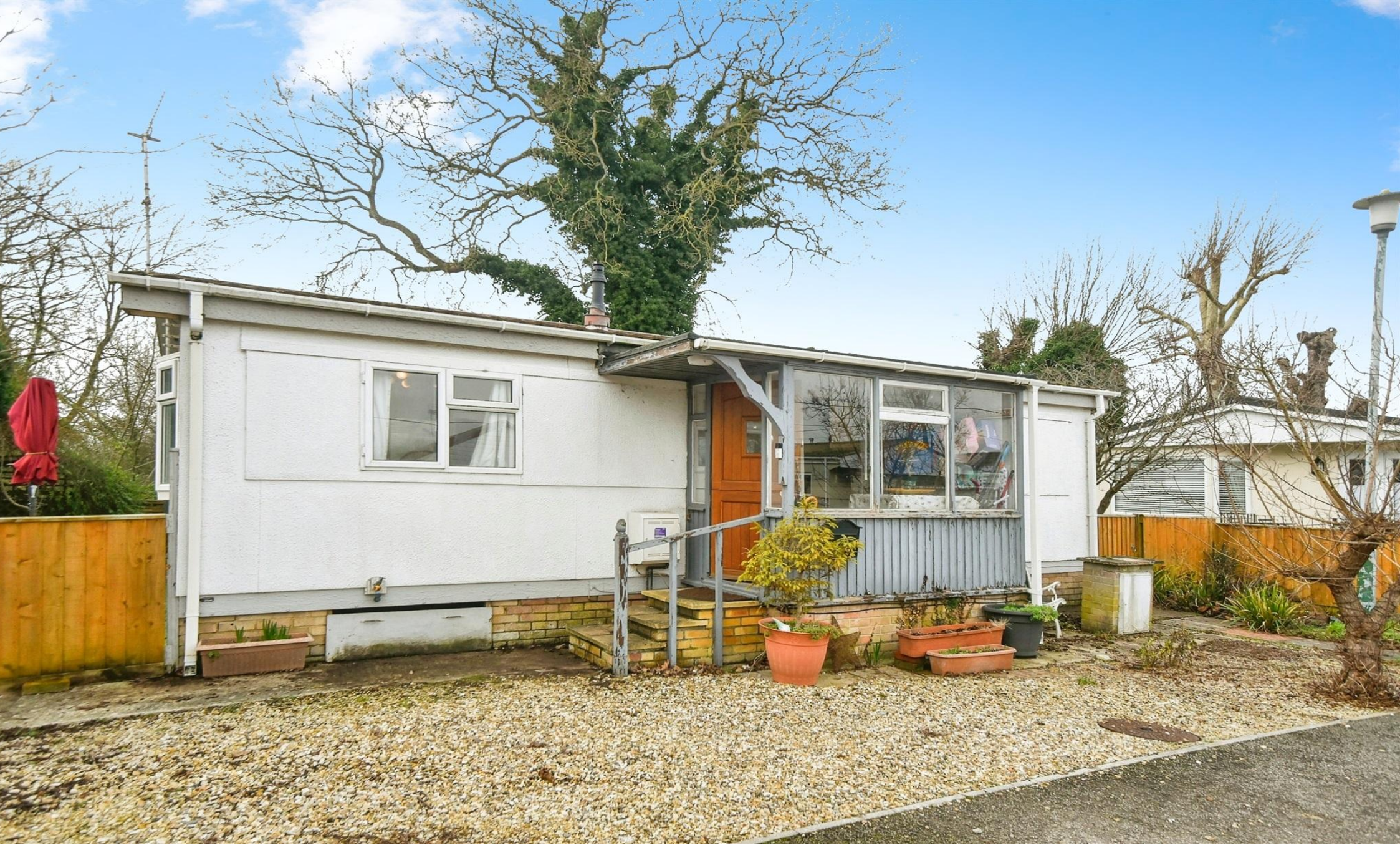
Bridge Close St. Johns Priory, Lechlade GL7 3EZ