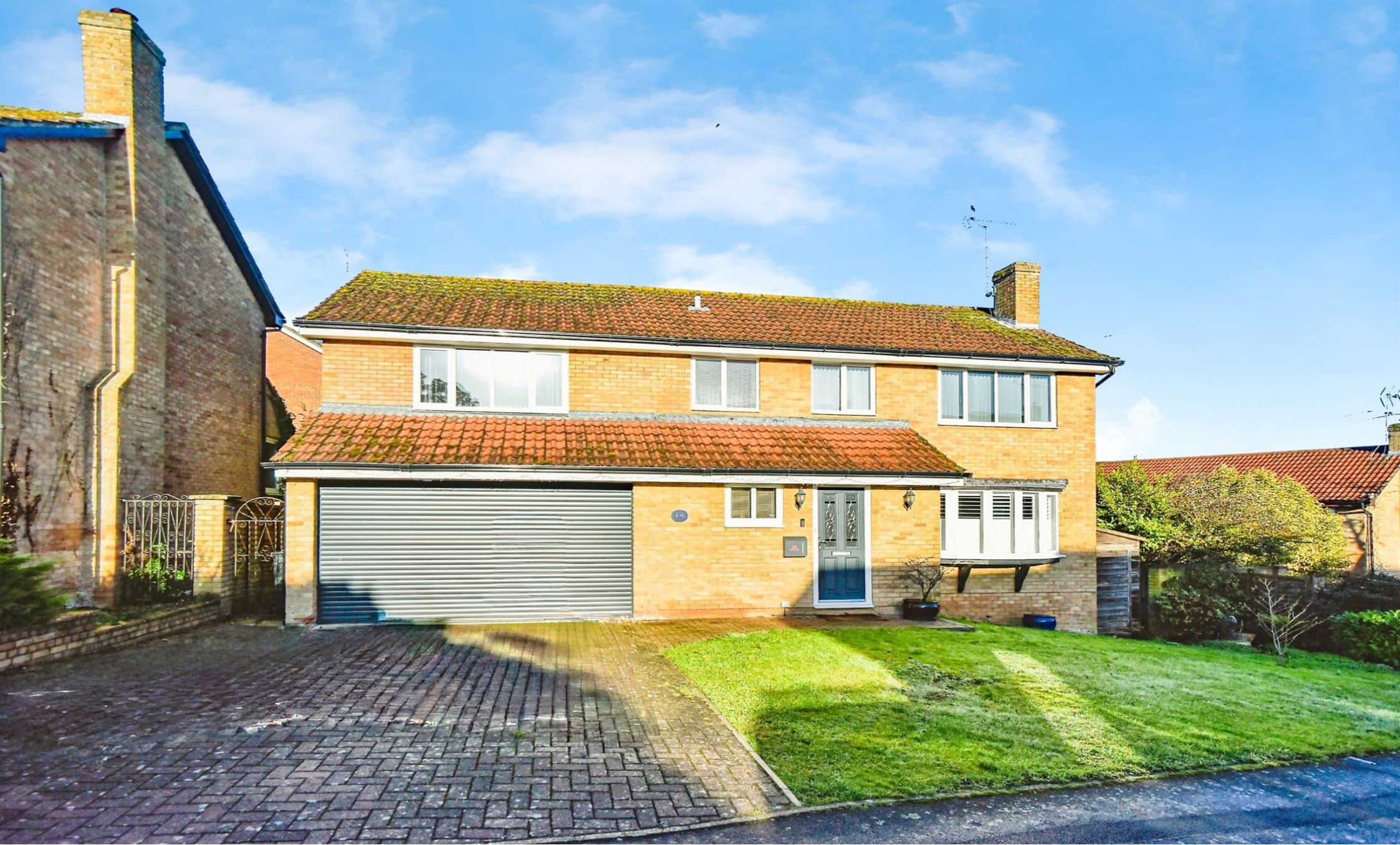
The Willows, Highworth Swindon SN6 7PG