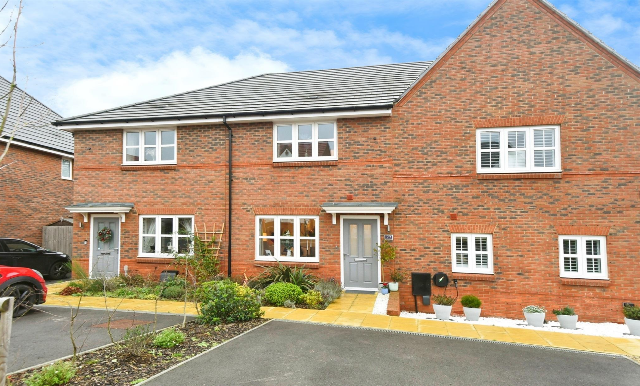
Merchant Crescent, Faringdon SN7 7EQ