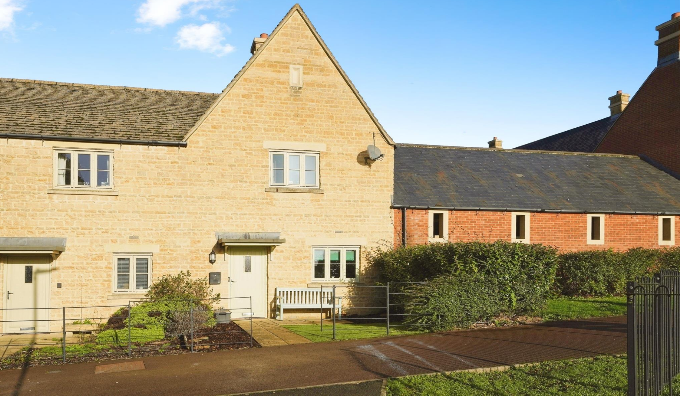
Peckham Walk, Cirencester GL7 1FB