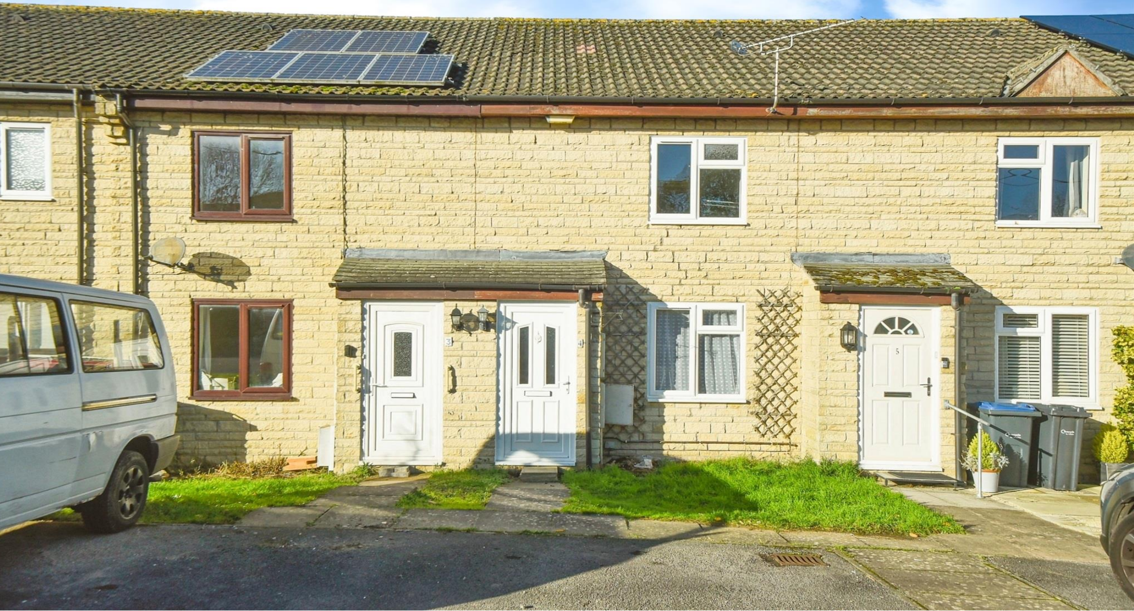
Vale Court, Cricklade Swindon SN6 6EJ