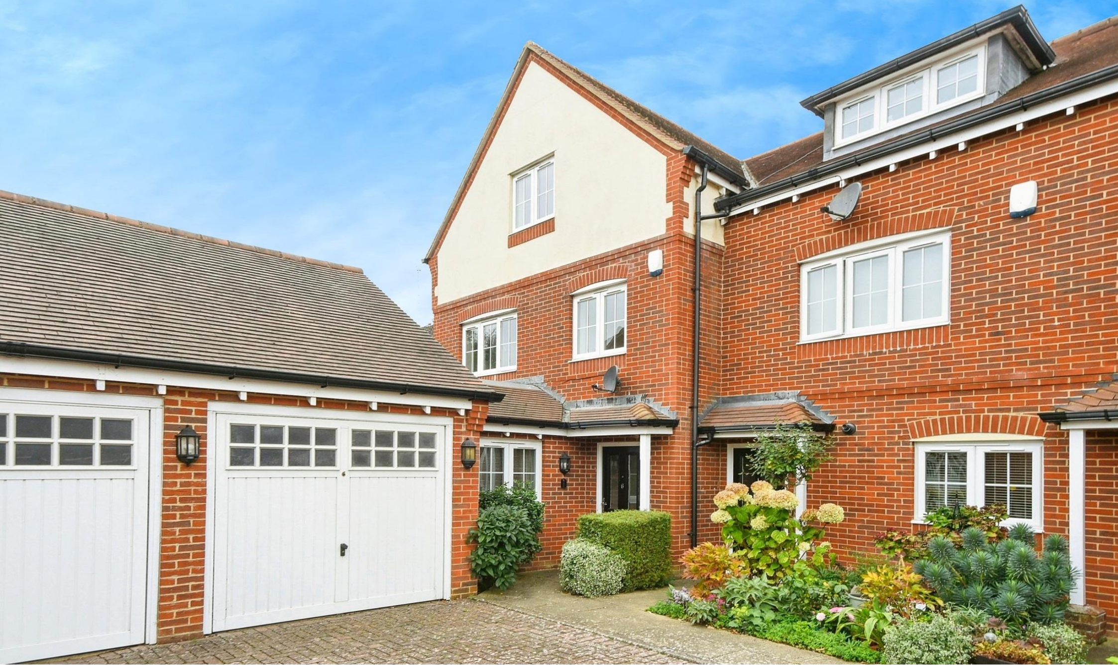
Berry Close, Faringdon SN7 7FL