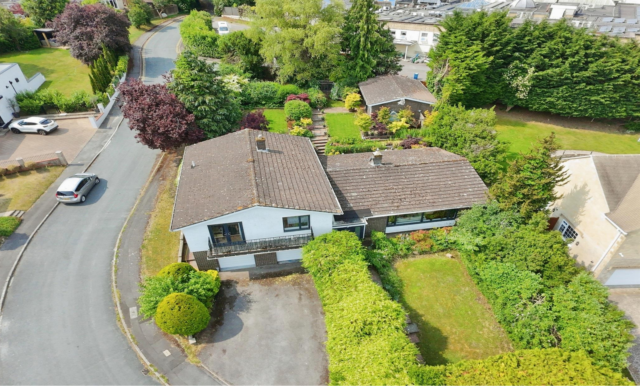
The Ridge, Blunsdon Swindon SN26 7AD