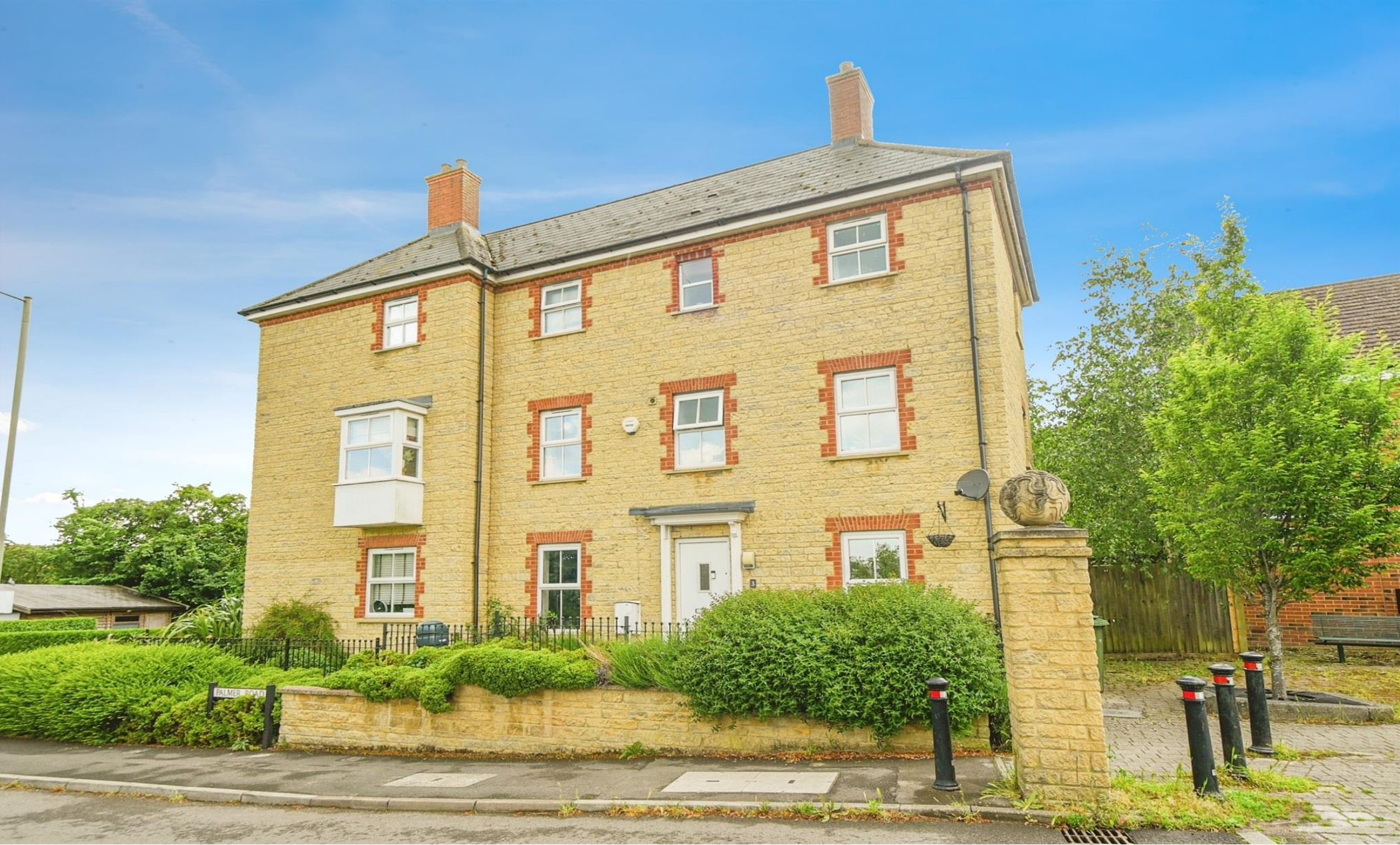
Palmer Road, Faringdon SN7 7FR