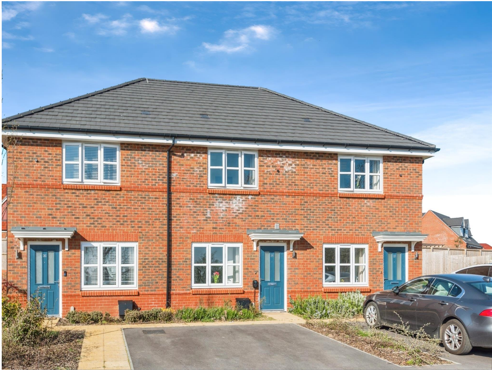
Merchant Crescent, Faringdon SN7 7EQ