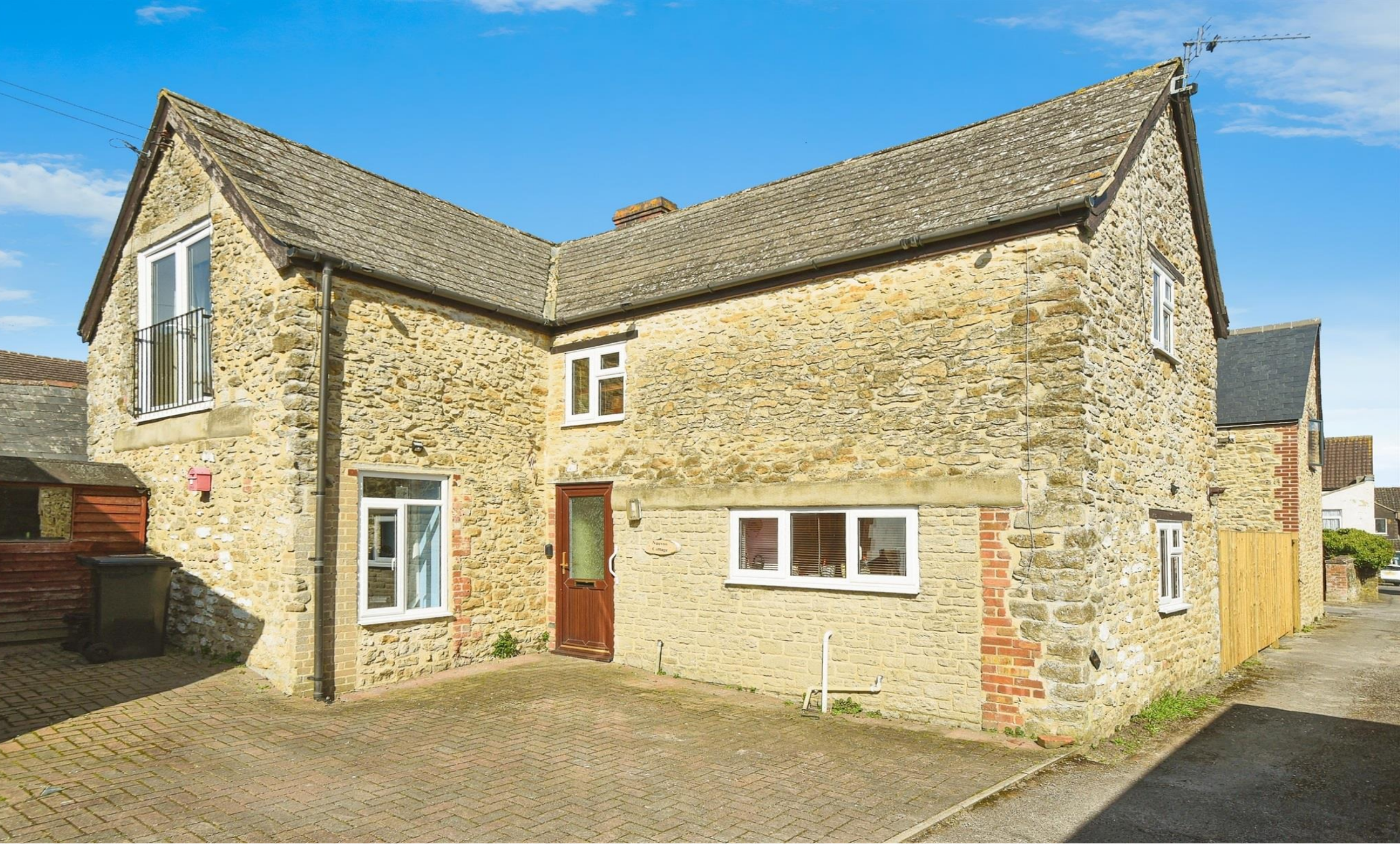
Nauvoo Cottage Cherry Orchard, Highworth Swindon SN6 7AU