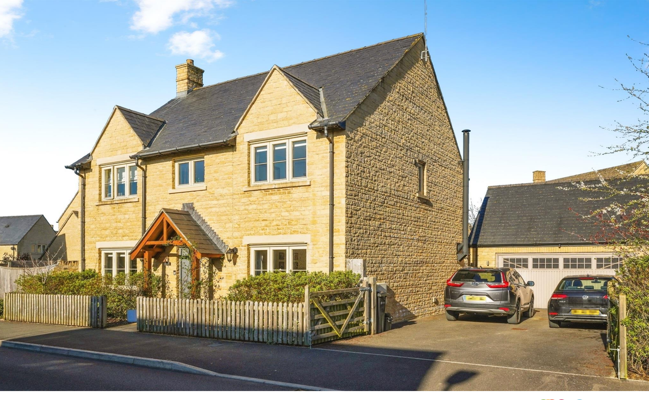
Nightingale Way, South Cerney Cirencester GL7 5WB