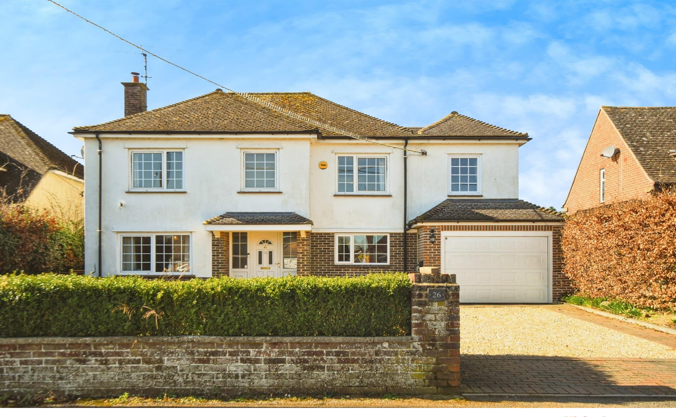
Fairthorne Way, Shrivenham Swindon SN6 8EB