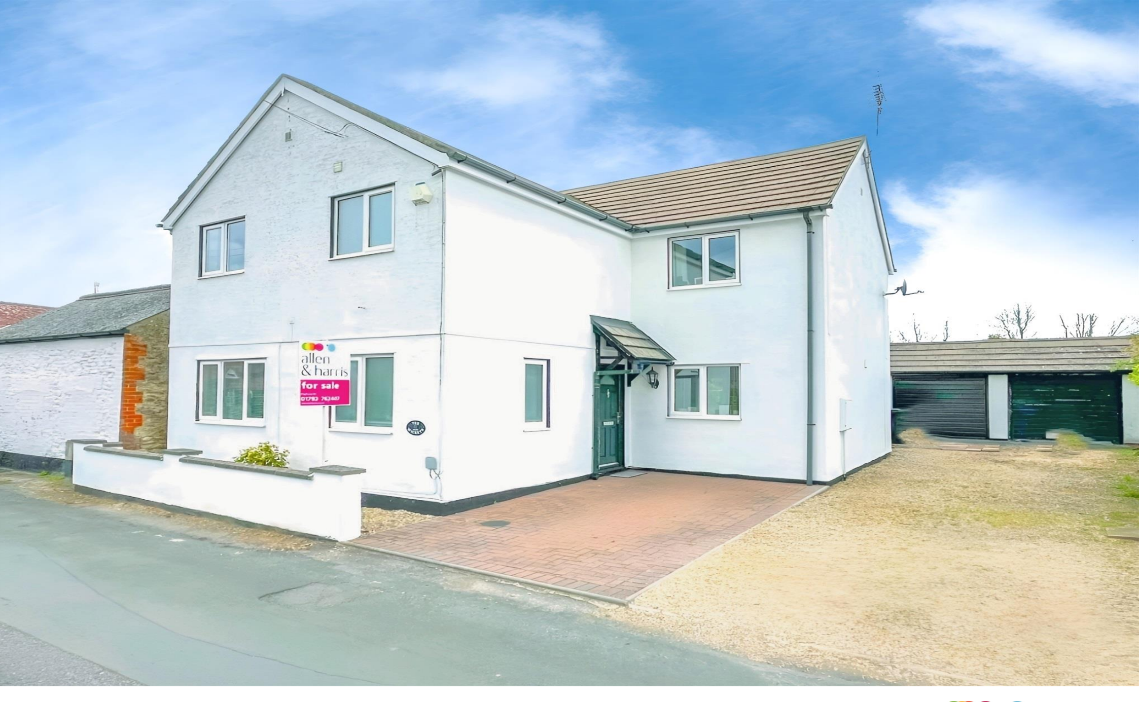
The Wickets Highworth Road, South Marston Swindon SN3 4SB