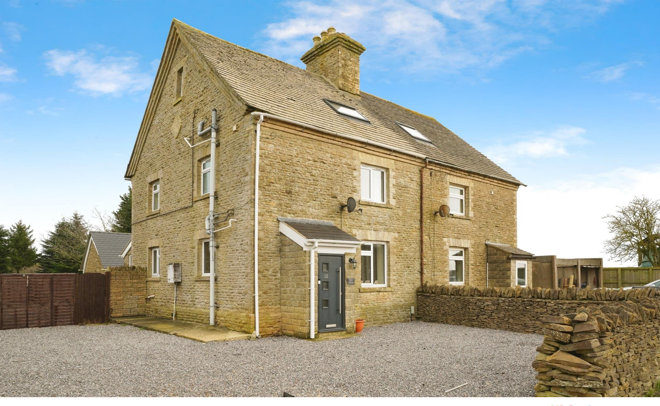
Final Approach Pay-Yat, Kemble Cirencester GL7 6AY