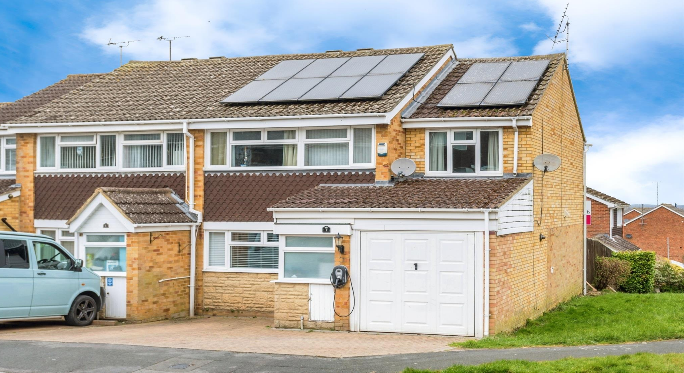
Bute Close, Highworth Swindon SN6 7HN