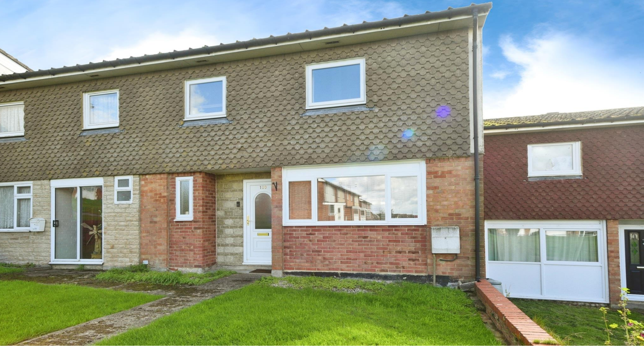
Home Farm, Highworth Swindon SN6 7EH