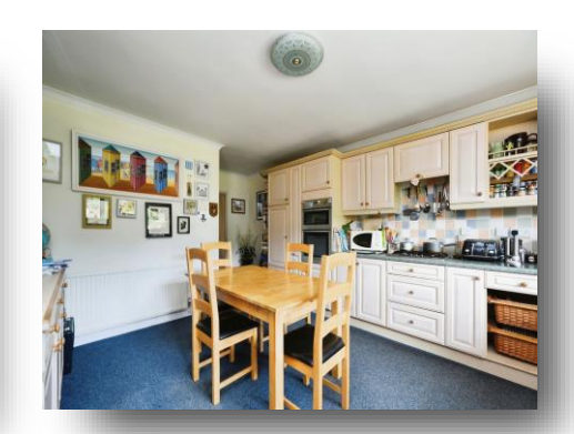
Fileworth Rd.