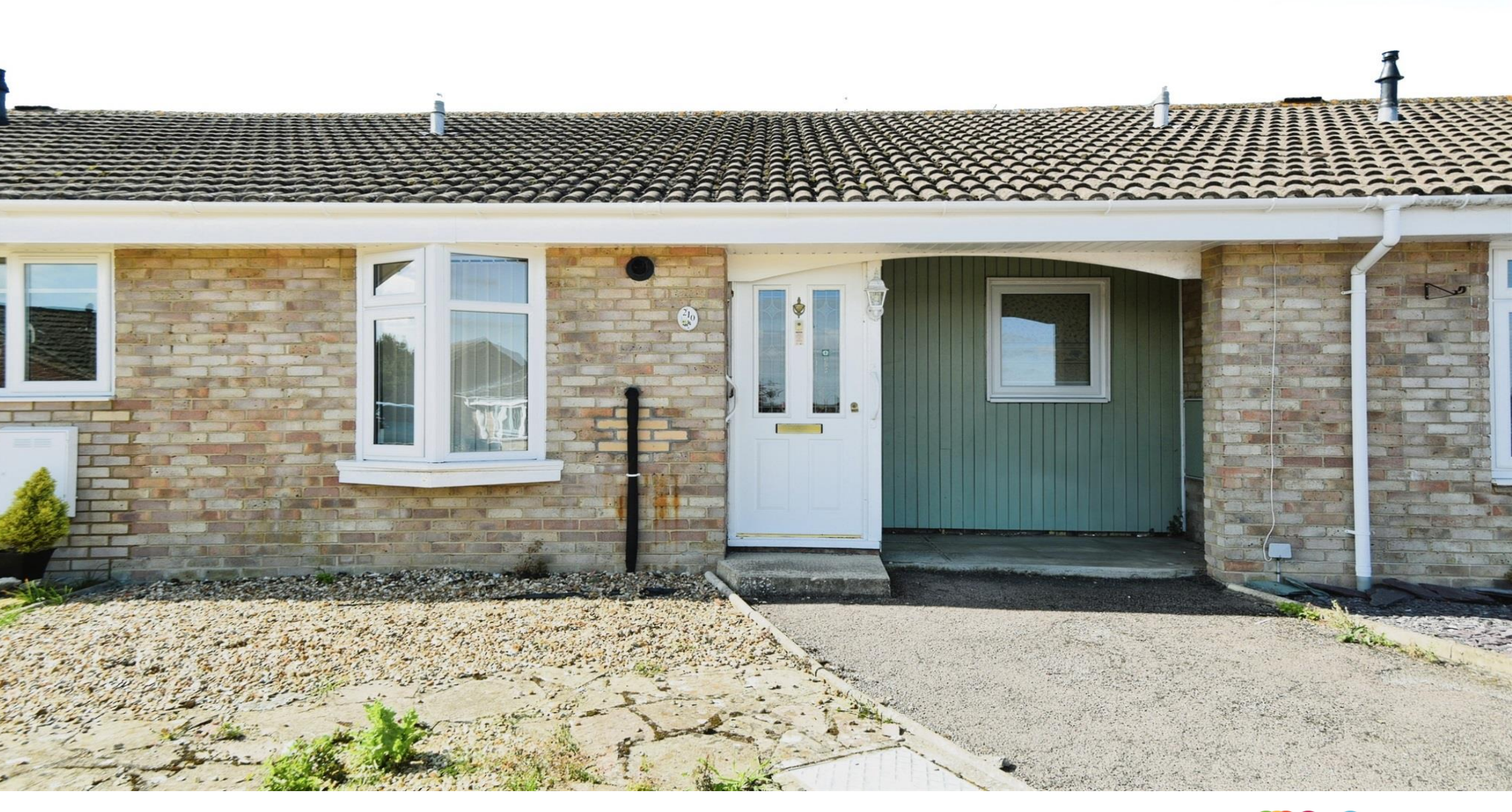
The Cullerns, Highworth Swindon SN6 7NL