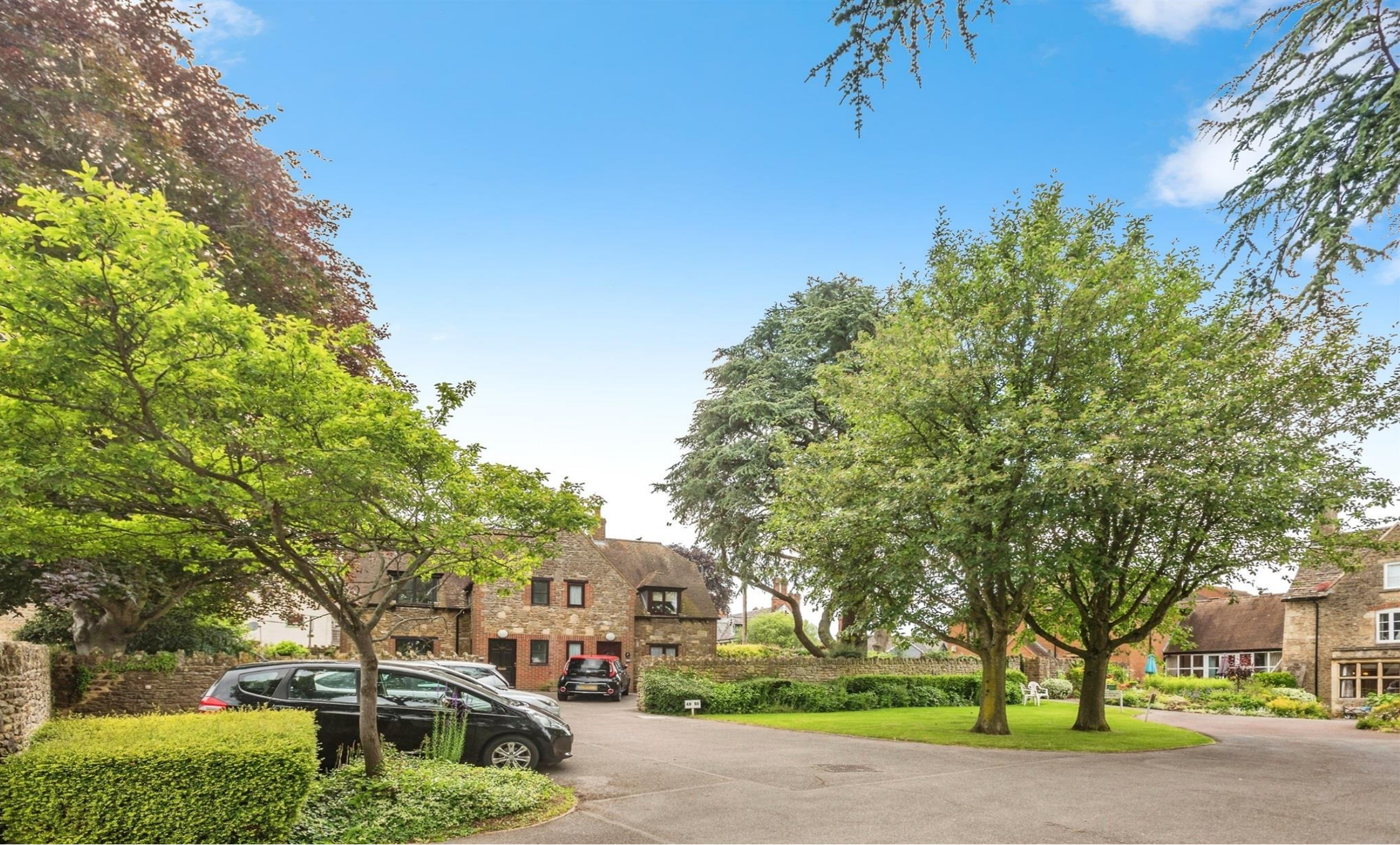
Parsonage Court, Highworth Swindon SN6 7TJ