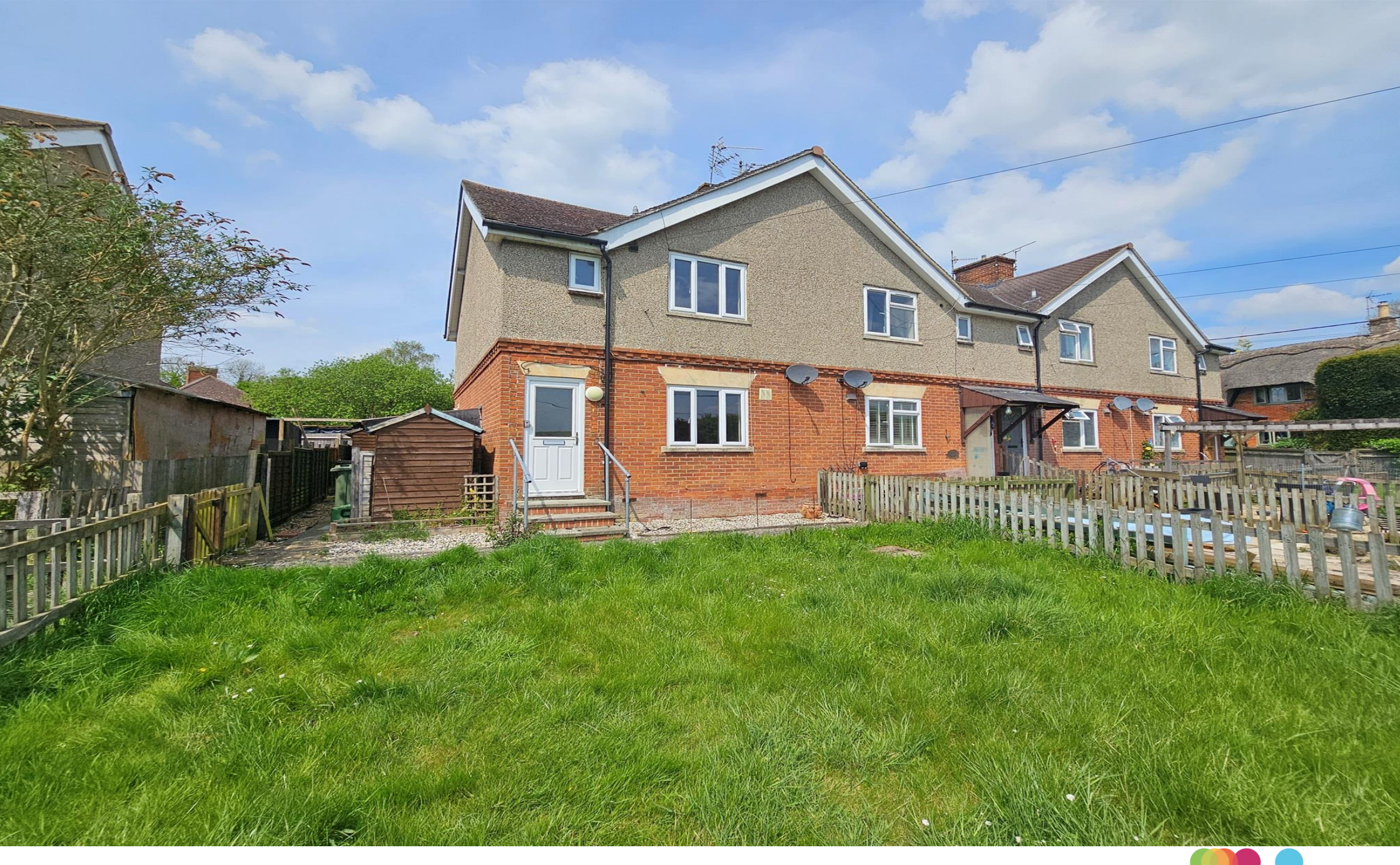
The Granthams, Lambourn Hungerford RG17 8YF