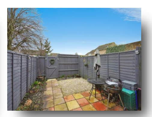
A361 Sevenfields Knowlang