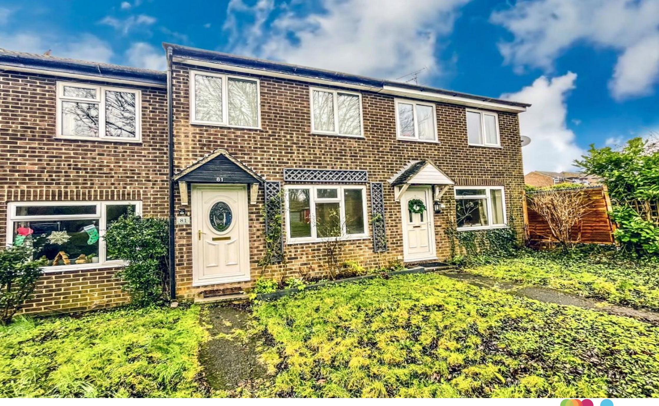
Sevenfields, Highworth SWINDON SN6 7NG