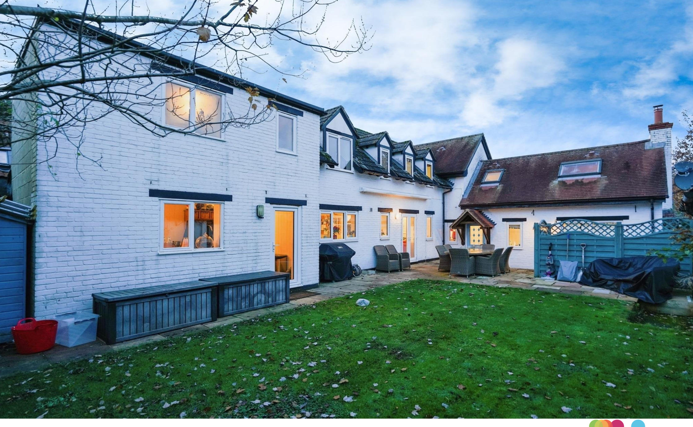
New House High Street, Fernham Faringdon SN7 7NY