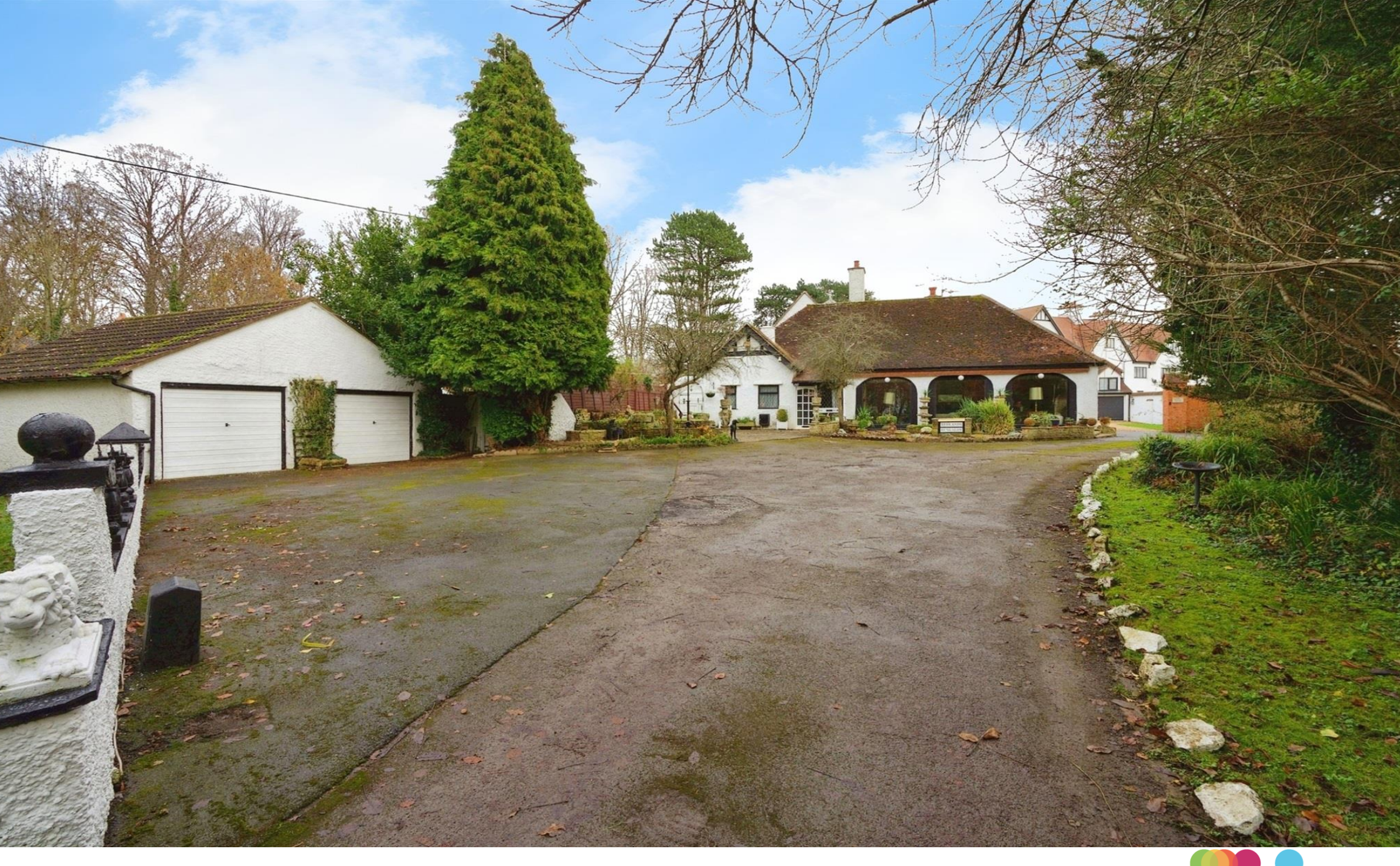
Redlands Bungalow Swindon Road, Highworth Swindon SN6 7SW