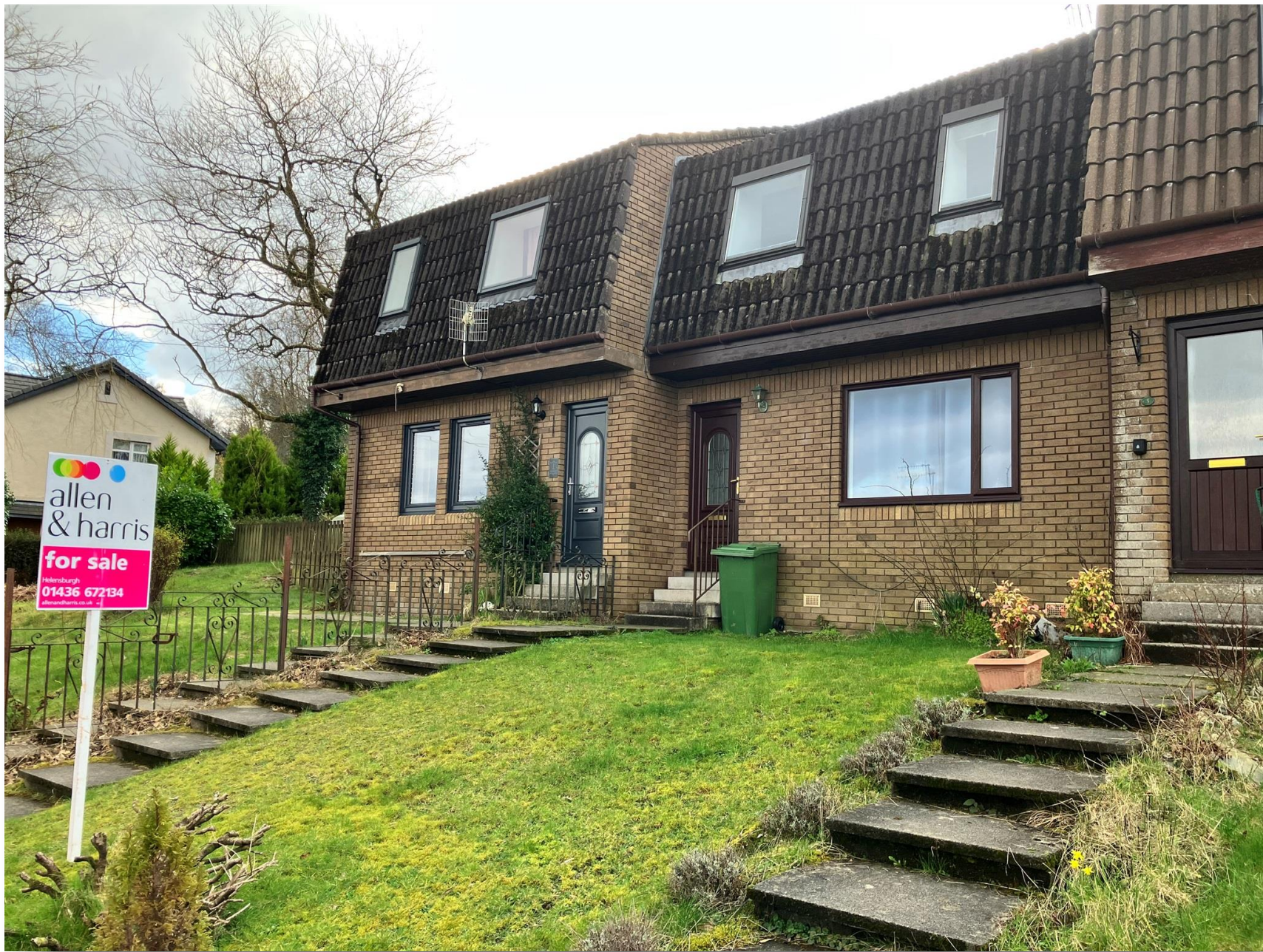
The Soundings, Clynder Helensburgh G84 0QL