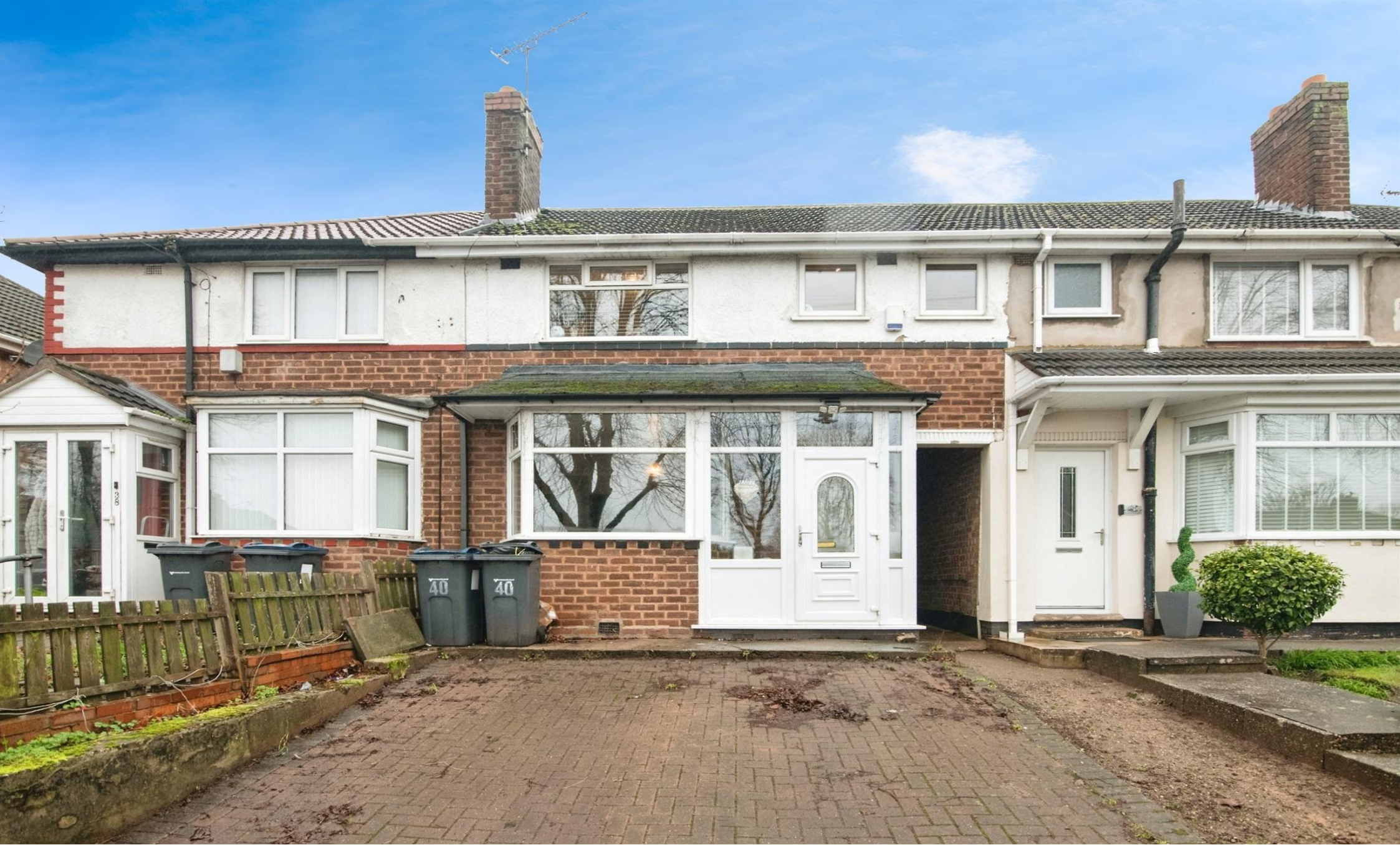
Old Oscott Lane, Great Barr Birmingham B44 8TP