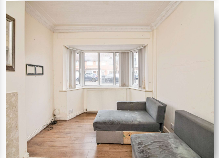
Grindleford Road, Great Barr Birmingham B42 2SG