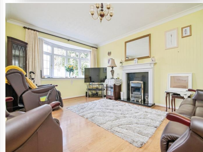
Beechglade, Birmingham B20 1LA