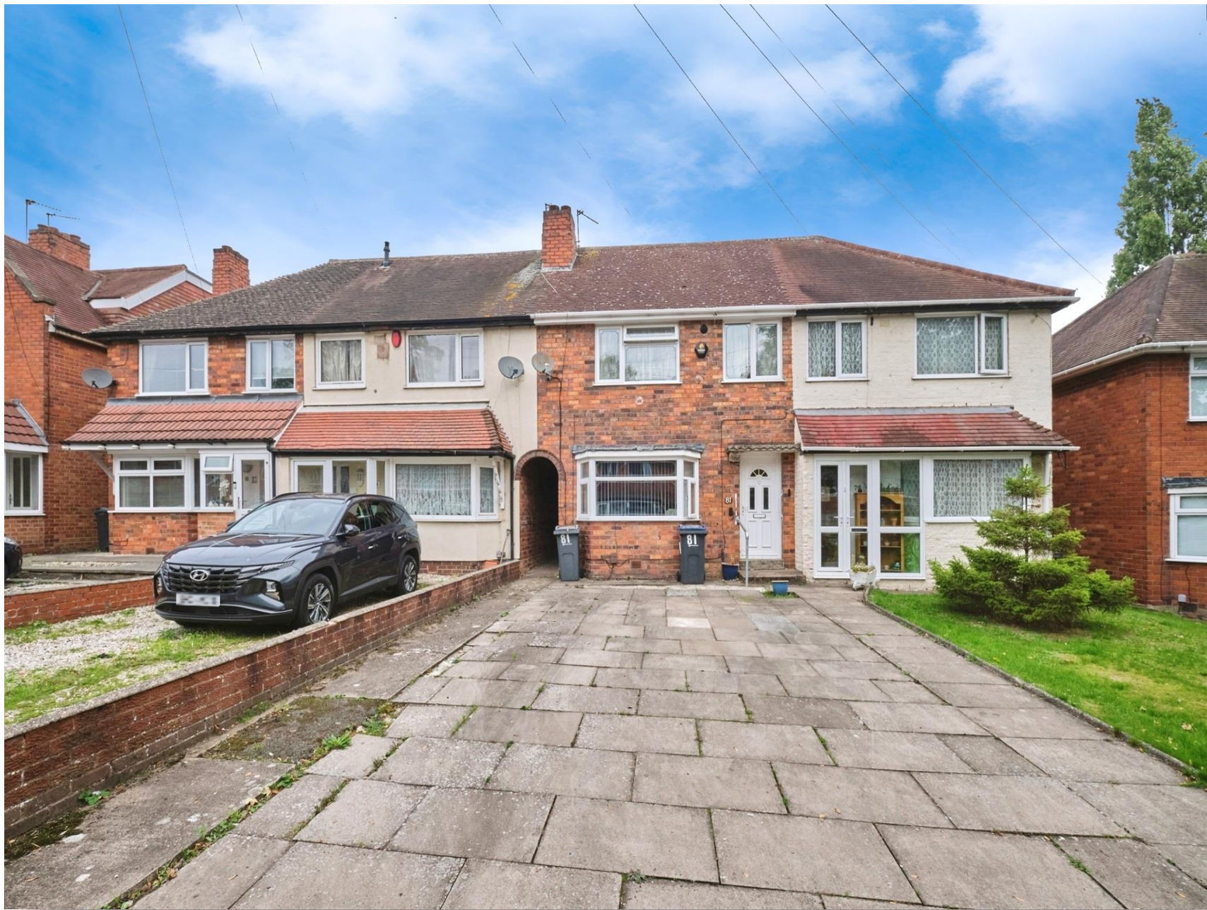
Curbar Road, Birmingham B42 2AT