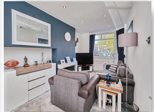
Rocky Lane,Great Barr Birmingham B42 1NG