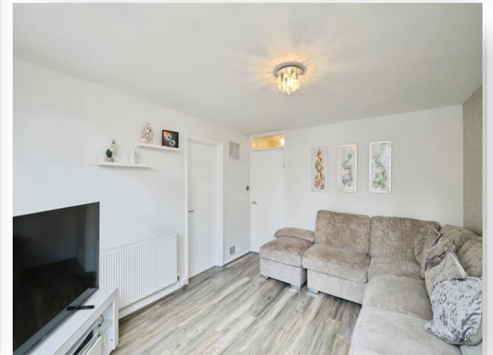
Victoria Road,Aston BIRMINGHAM B6 5ET