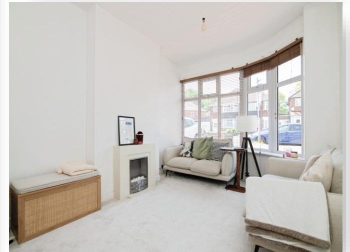
Cardington Avenue, Birmingham B42 2PA