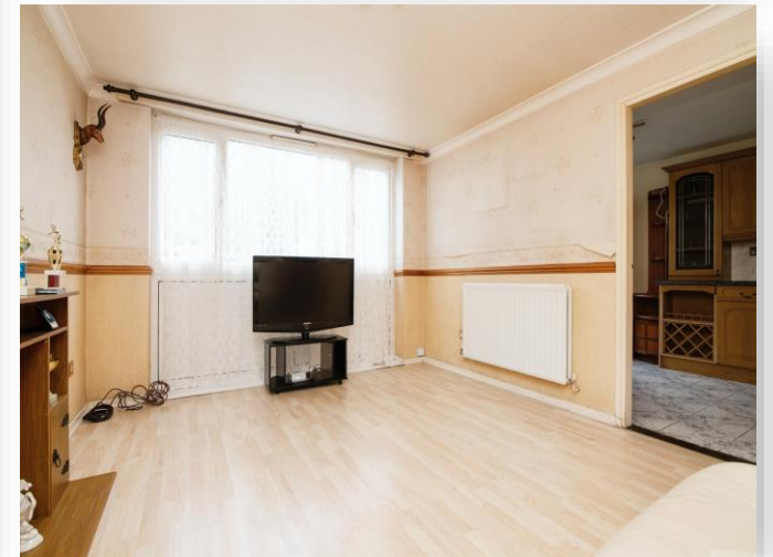
Markford Walk, Birmingham B19 2HD