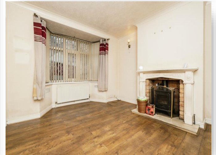
Merrions Close, Birmingham B43 7AT