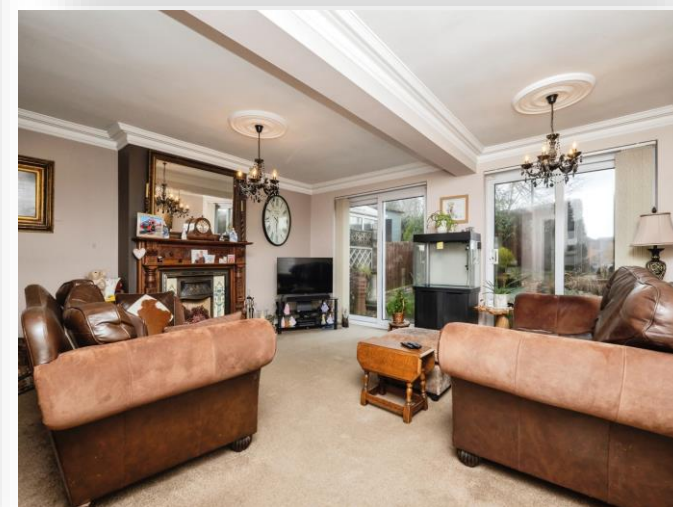
Perry Park Crescent, BIRMINGHAM B42 2LS