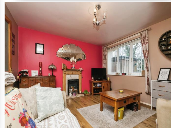
Kingsdown Avenue, Birmingham B42 1NF