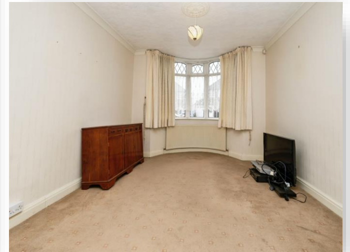
Yateley Avenue, Birmingham B42 1JL