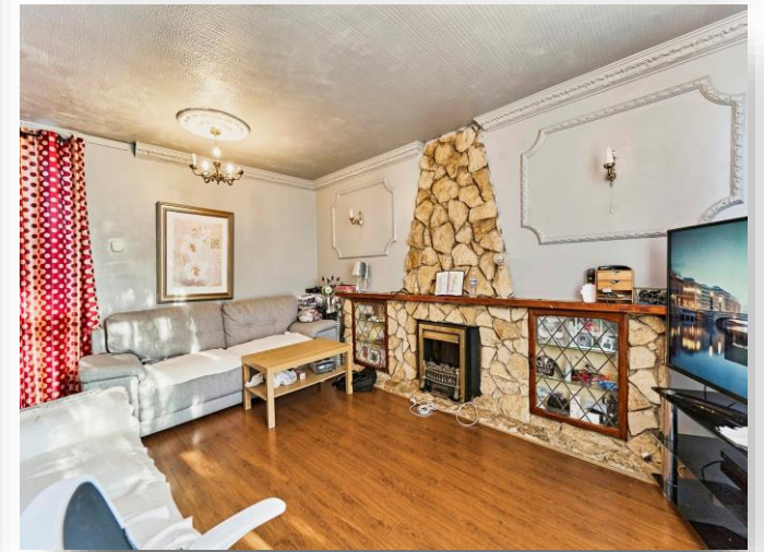
Sarah Gardens, Walsall WS5 4PP