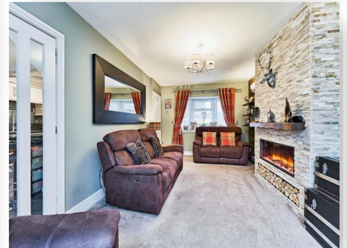
Lime Tree Road, Walsall WS5 4HA