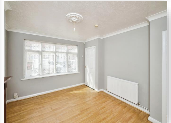
Chingford Road, Birmingham B44 0BQ