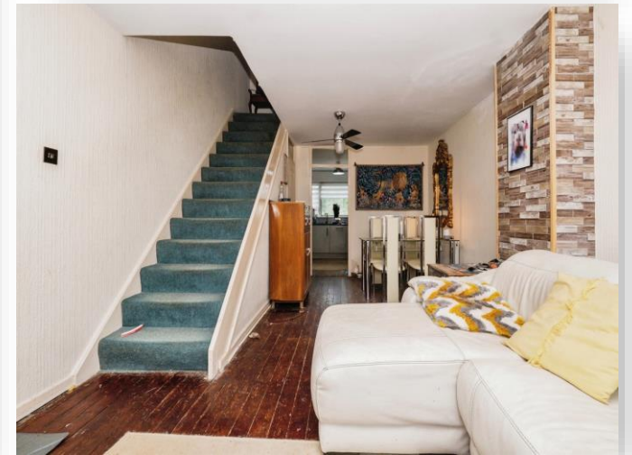
Meadowside Close, Great Barr Birmingham B43 6BP