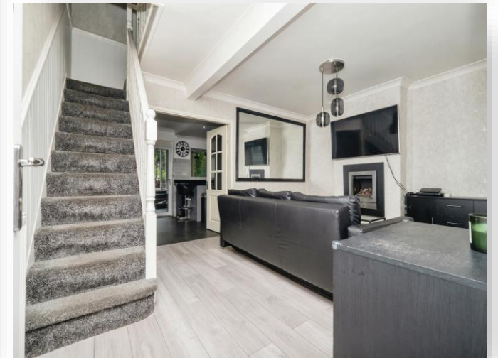
Queslett Road, Birmingham B43 7EJ