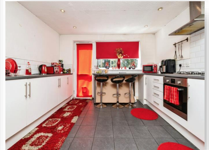
Whitburn Avenue, Birmingham B42 1QH